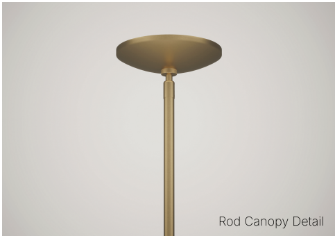
Rod Canopy Detail