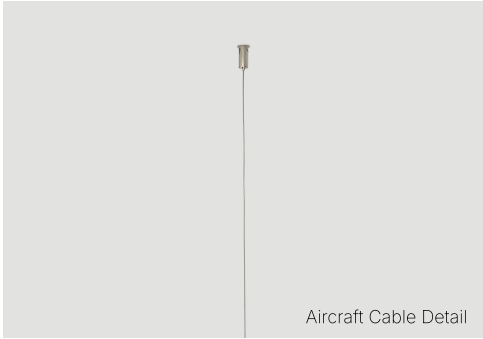
Aircraft Cable Detail