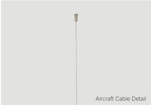
Aircraft Cable Detail

Overall: 72in L x 29in H Weight: ~20 pounds Canopy Diameter: 5 inches